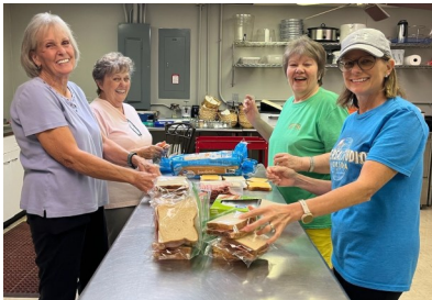
Faithful servants helping prepare sack dinners from the Allen Bowden football team.